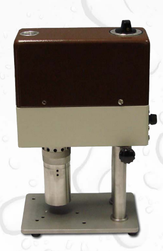
130-10-C - Model 800 Viscometer With Carrying Case